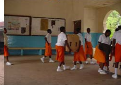
Tambaza High School in Dar Es Salaam receives computers from Rotary Club of Chelmsford Mildmay